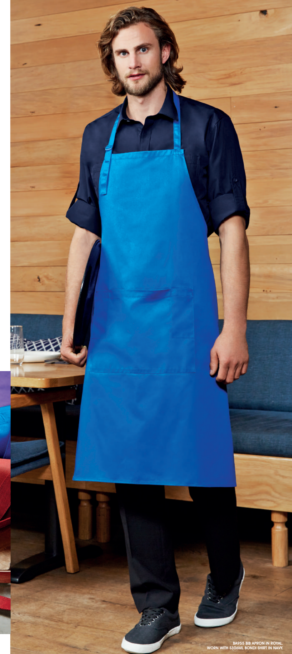
BA95 BIB APRON IN ROYAL. WORN WITH 8306ML BONDI SHIRT IN NAVY.